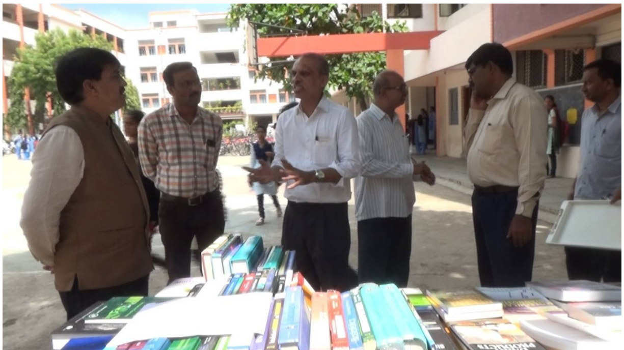
Manager of the Navkar Book Distributor introduced books available in exhibition.